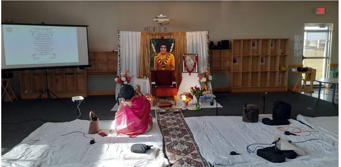
A Memorable front view of how the Main hall was setup and decorated on our inaugural session August 13th 2023