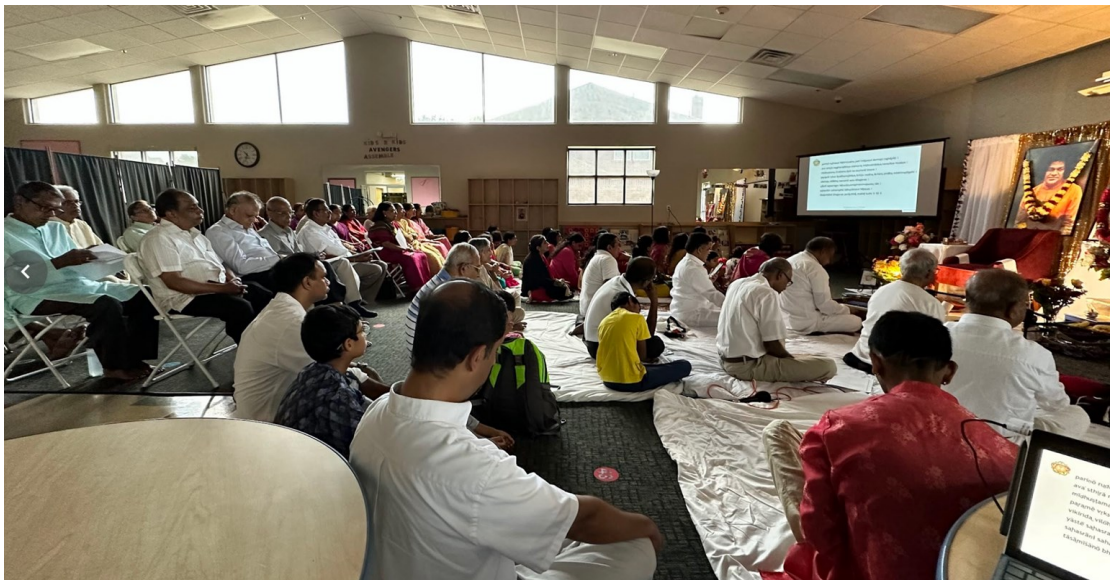
A Memorable side view of how the Main hall was setup and decorated on our inaugural session August 13th 2023